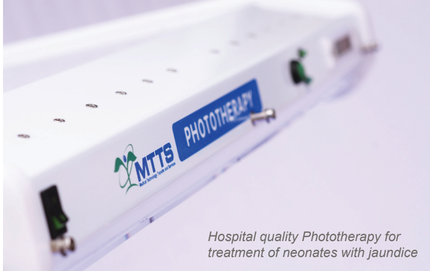
Hospital quality Phototherapy for treatment of neonates with jaundice