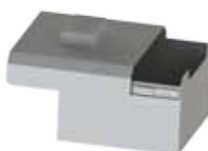
Storage Drawer (WLB-1050)