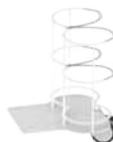
Cylinders Holder (WLB-1060)